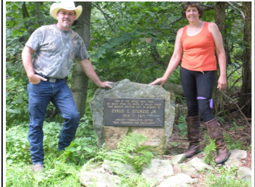
Yeah they made it!!!!